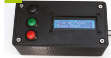
Build a Pico LCD Game