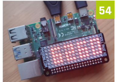
Create a pomodoro timer