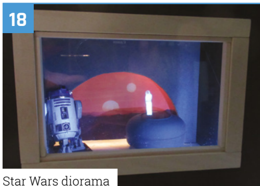
Star Wars diorama