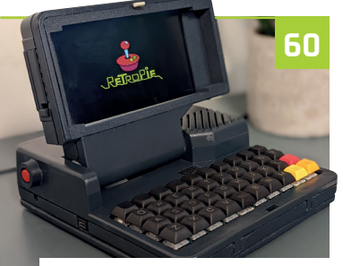
How I made Ceres-1 Portable