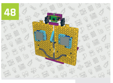
AI-powered LEGO face