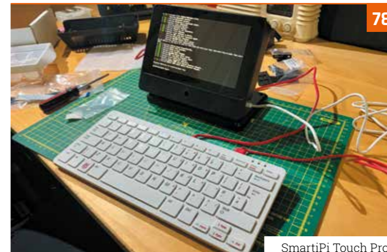
SmartiPi Touch Pro