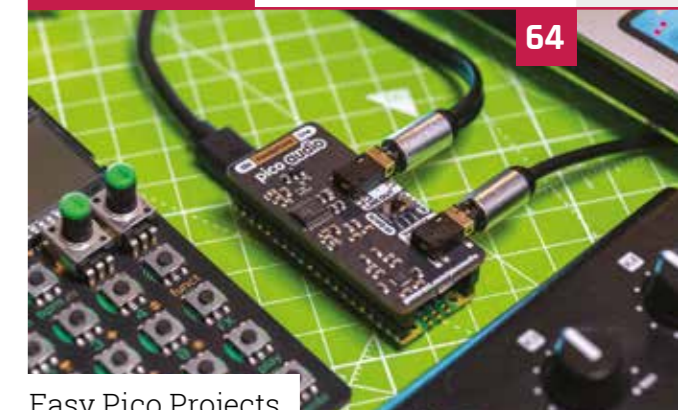
Easy Pico Projects