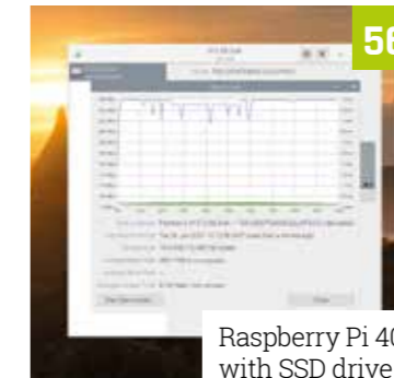
Raspberry Pi 400 with SSD drive