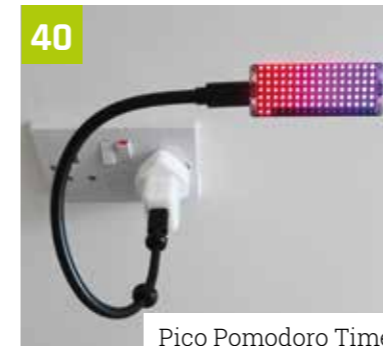
Pico Pomodoro Timer